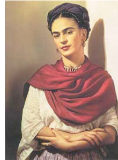
Frida Kahlo Artist - Mexico 1907-1954